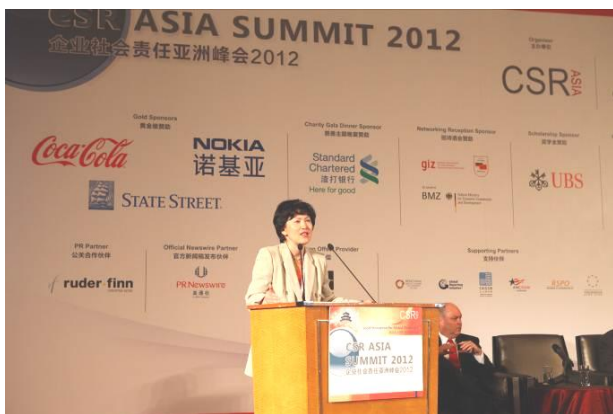
Logo exposure on backdrop