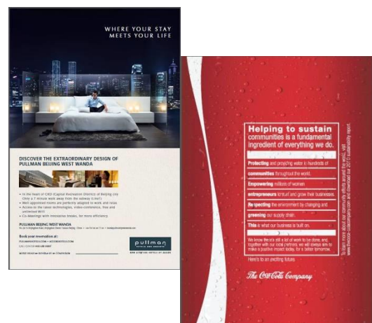
Full page advertisement in the Summit booklet